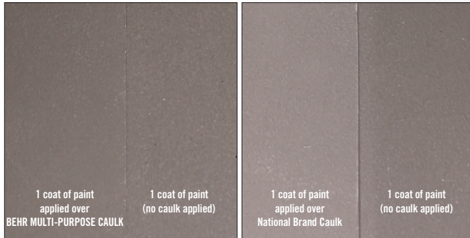
BEHR® MULTI-PURPOSE CAULK