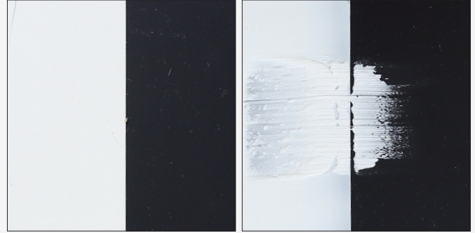
BEHR® RAPID DRY CAULK