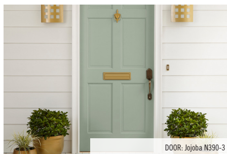
DOOR: Jojoba N390-3

Also suitable for use on properly prepared drywall, masonry, and metal surfaces.