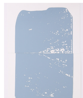
NATIONAL BRAND 2 Semi-Gloss

Paints tinted to a blue color are applied to sealed test charts at three mils wet film thickness. After drying for two hours, the charts are cut into two pieces, placed face-to-face, and then compressed with a weight that exerts a pressure of one pound-per-square inch. After 24 hours, the face-to-face sections are pulled apart with slow and steady force to evaluate how the paint resists sticking together.