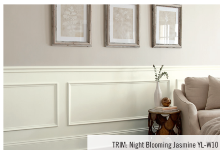
TRIM: Night Blooming Jasmine YL-W10