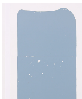
NATIONAL BRAND 1 Semi-Gloss