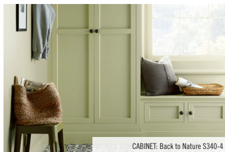
CABINET: Back to Nature S340-4